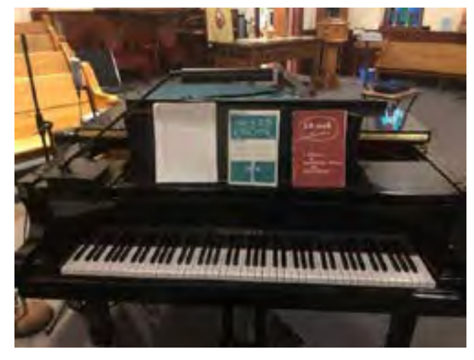
Heintzman Baby Grand Piano

If interested, email office@eppc-ucc.com with subject "Choir Director" Compensation is $145 to $155 per week ($7,500 - $8,000 per year)